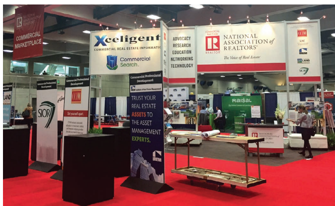
COMMERCIAL PROFESSIONAL DEVELOPMENT CENTER