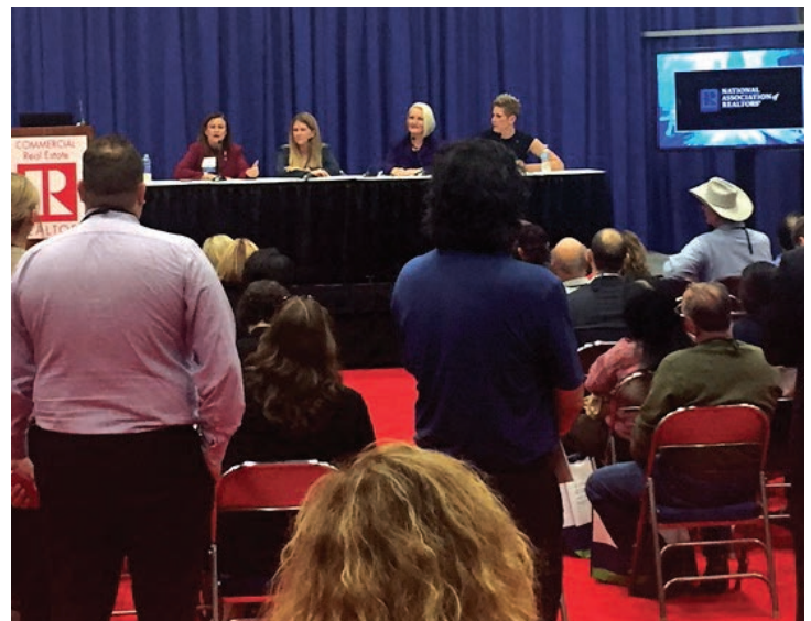
LEARNING THEATER SPONSORED BY COMMERCIALSEARCH.COM