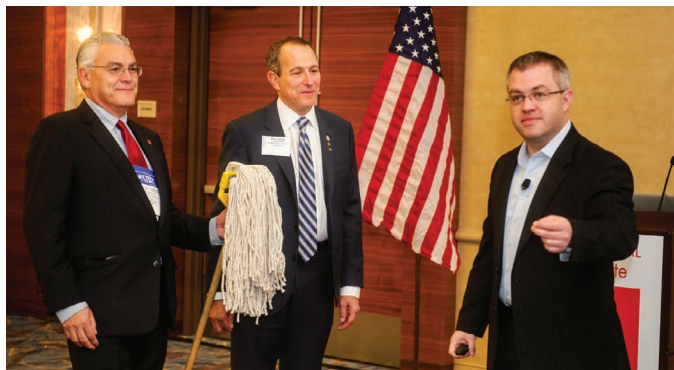
COMMERCIAL NETWORKING BREAKFAST

From the audience involving Commercial Networking Breakfast to the Commercial Lending & Financing Landscape education session, to the all-new Commercial Marketplace and the Learning Theater sponsored by CommercialSearch.com – commercial took the spotlight and was shining brightly all week. To read a full recap visit Realtor.org/Commercial .