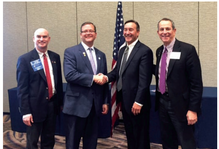
COMMERCIAL LEGISLATION & REGULATORY ADVISORY BOARD LEADERSHIP AND CONGRESSMAN RICK BERG, CCIM