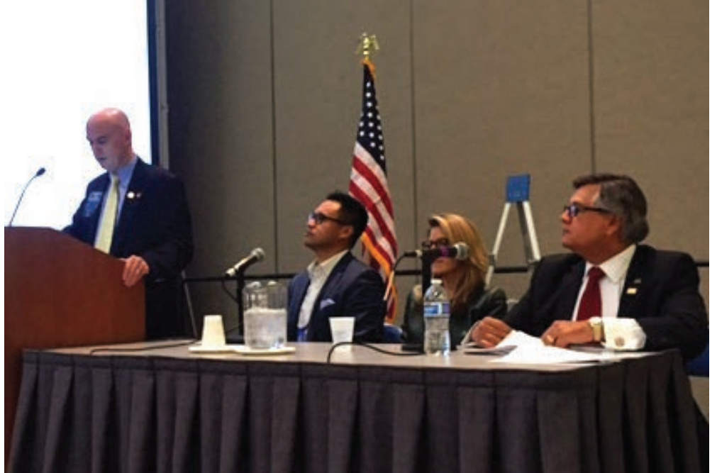
THE COMMERCIAL LENDING PANEL