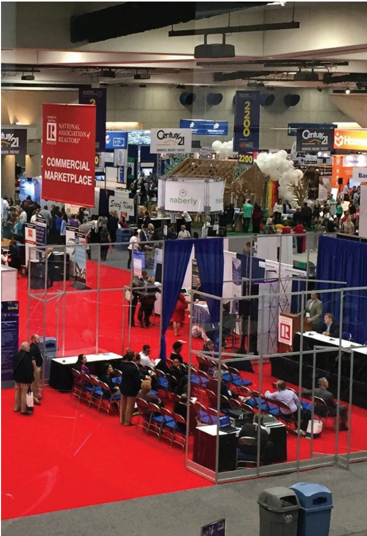
THE COMMERCIAL MARKETPLACE