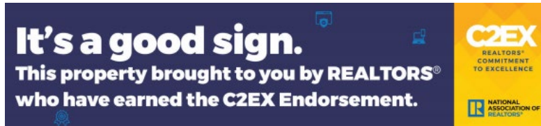
Slider Sign for Listings