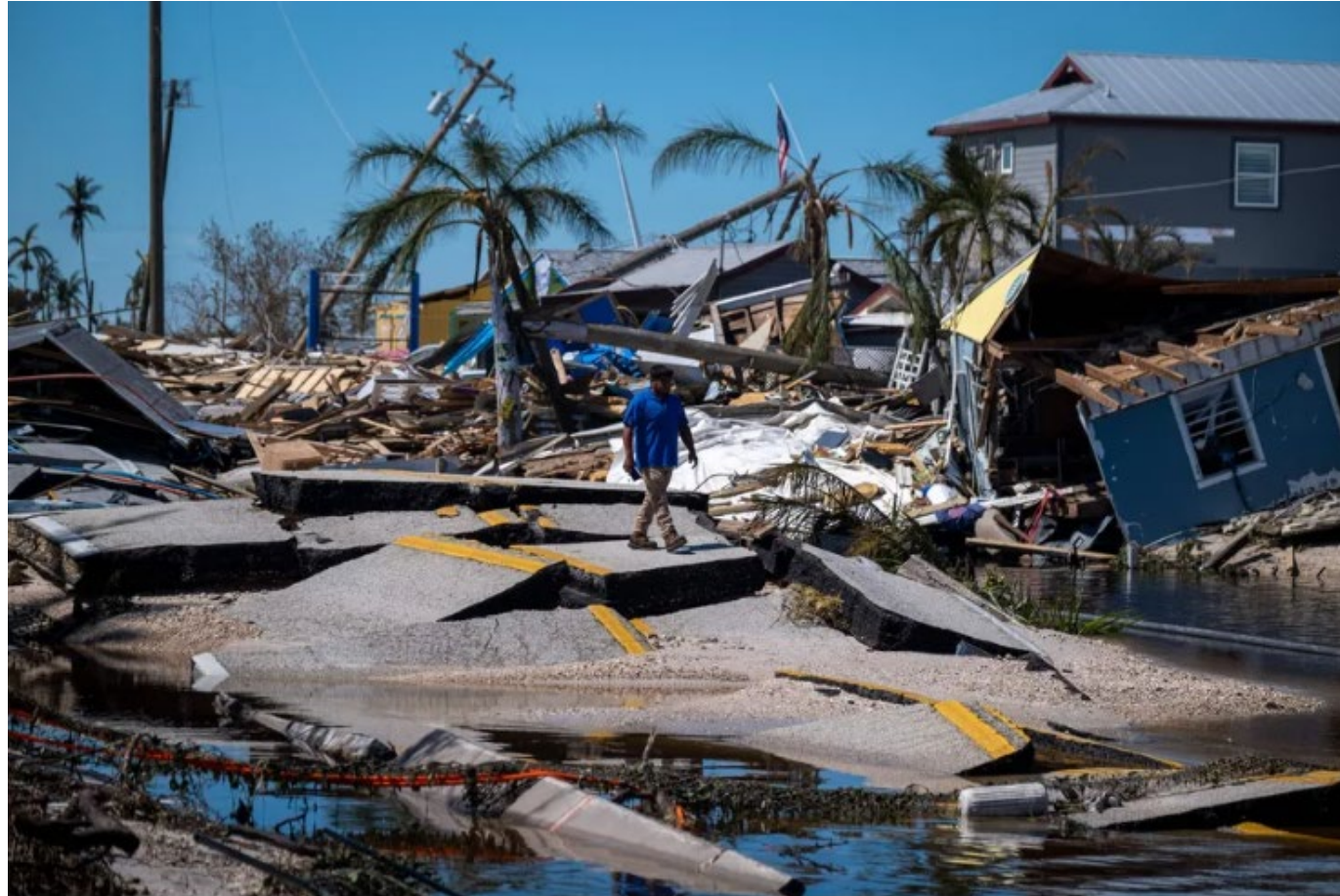
Hurricane Ian's death toll is still rising.