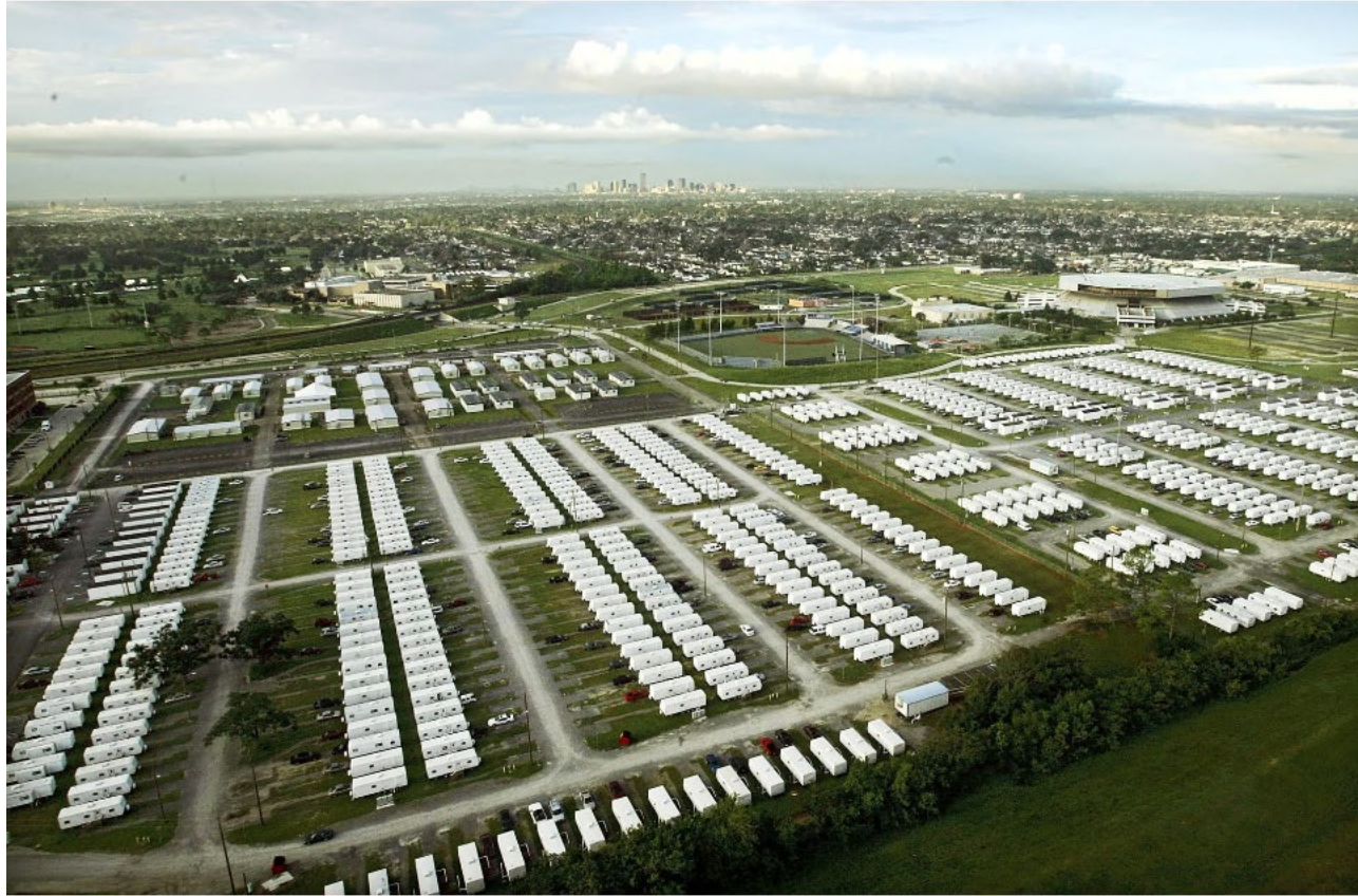
A large FEMA trailer park is seen next to the University of New Orleans campus in the Lakeview area August 25, 2006 in New Orleans, LA.