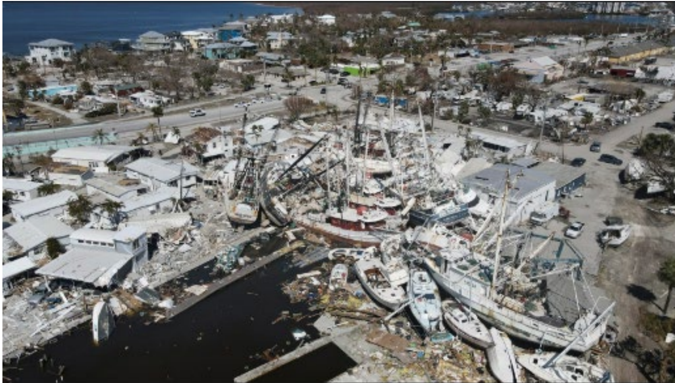
Shrimp boats lie grounded atop what was a mobile home park, following the passage of Hurricane Ian, on San Carlos Island in Fort Myers Beach, Fla., Friday, Oct. 7, 2022.